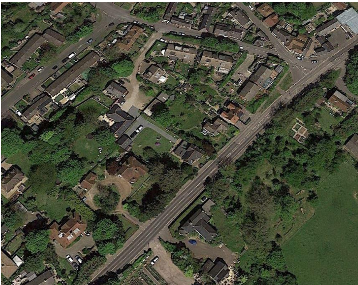
AP 1. View of proposed development area (2019)