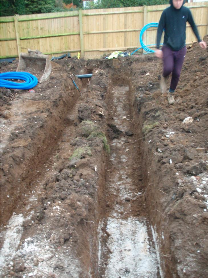
Plate 1. View of the foundation trenches (looking W)