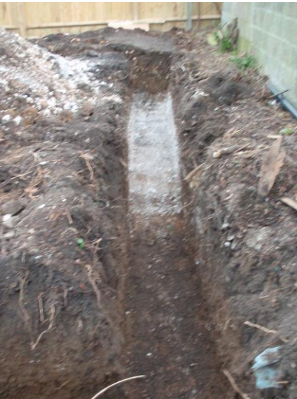
Plate 6. Foundation trench (looking east)