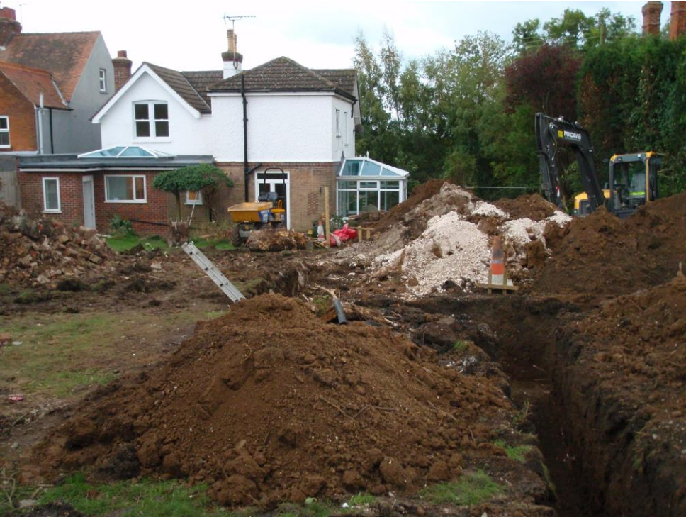
Plate 2. View of foundation trenches (looking SE)