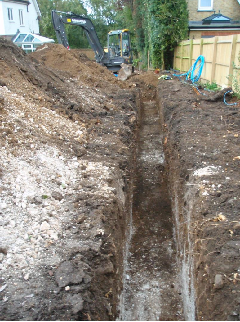
Plate 5. Foundation trench (looking south)