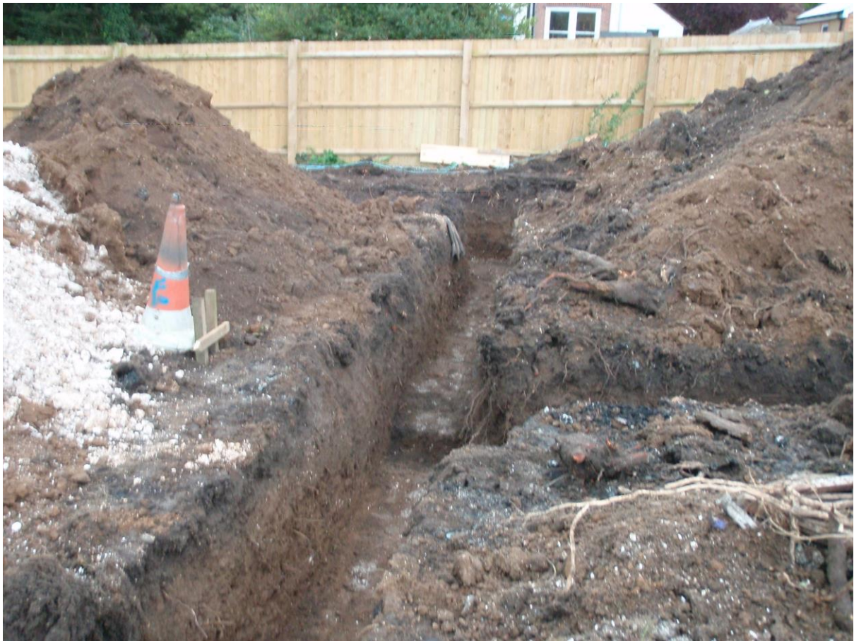
Plate 3. Foundation trench (looking NE) and Plate 4 looking south (below)